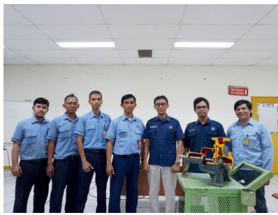
PT NT Piston Ring Indonesia (PT NTPRI)

EBARA Indonesia recently specialized pump training sessions at PT YAMAHA MUSIC ASIA (PT YMPA) and PT NT Piston Ring Indonesia.